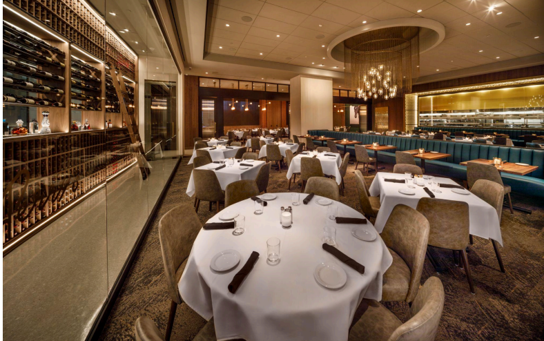
Main dining room