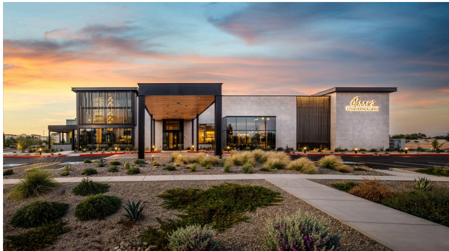
A first for Arizona, Perry's Steakhouse & Grille opens in Gilbert today Monday, June 8, at 1865 S. SanTan Village Pkwy.

PHOENIX (June 8, 2026) – The wait is over – Perry's Steakhouse & Grille has officially opened its doors at Northside at SanTan Village, located along Loop 202 SanTan Freeway. As the brand's first restaurant in Arizona, every detail of the 11,000 square-foot restaurant was deliberately selected to create a Rare and Well Done® dining experience for Gilbert residents.