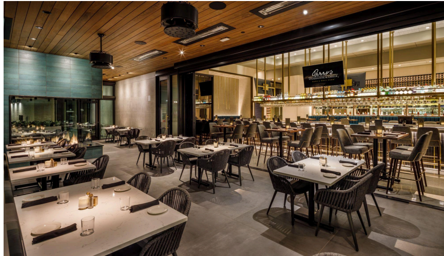
Gilbert Bar & Patio

The new location also includes four beautifully appointed private dining rooms ideal for corporate functions and family celebrations, serving parties from 8 up to 80. A dedicated sales manager will assist you with the specially curated menus that can be tailored to any taste.