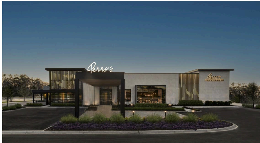
Exterior Rendering of Perry's Steakhouse & Grille in Omaha, NE

Omaha, NE – January 20, 2026 – Texas-based Perry's Restaurants, a group of award-winning restaurants, is proud to announce its first Nebraska location, Perry's Steakhouse & Grille , in the Greater Omaha area. Set to open in summer 2027, Perry's will be located at Avenue One , West Omaha's grandest new mixed-use community for prime shopping and dining.