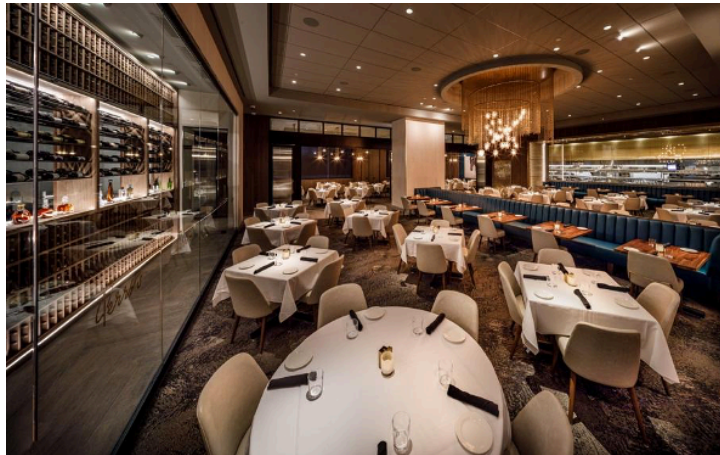
Omaha's 11,000-square-foot restaurant will include a stunning main dining room that provides glimpses of chefs creating innovations in the kitchen.

Chicago, Denver, Miami, Nashville, Raleigh, and Richmond, with another location set to open in Phoenix this year, making Omaha Perry's 13th location nationwide.