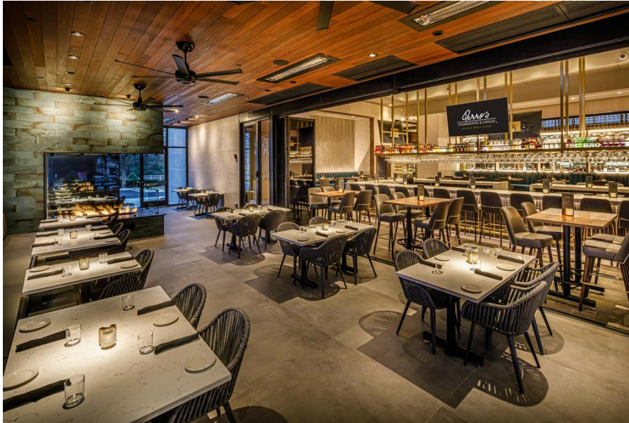
Outdoor Dining Patio