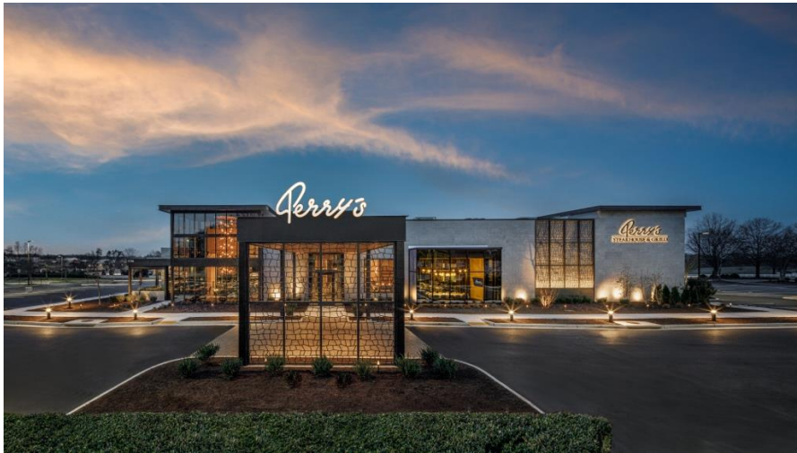
A first for River City, Perry's Steakhouse & Grille opened Monday, February 5, at 11788 W. Broad St. in Short Pump.

Richmond, VA (February 5, 2024) – The wait is over – Perry's Steakhouse & Grille has officially opened its doors at Short Pump Town Center, located along West Broad and I-64. As the brand's first restaurant in Virginia, every detail of the 11,000 square-foot restaurant was deliberately selected to create a Rare and Well Done® dining experience for Richmond residents.